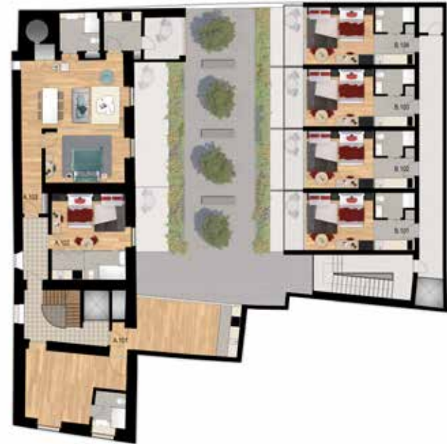
P01 - 1ST FLOOR