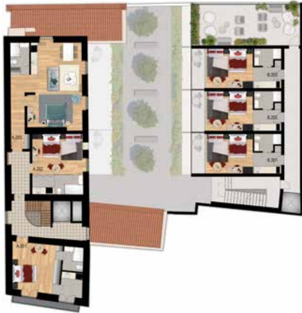
P02 - 2ND FLOOR