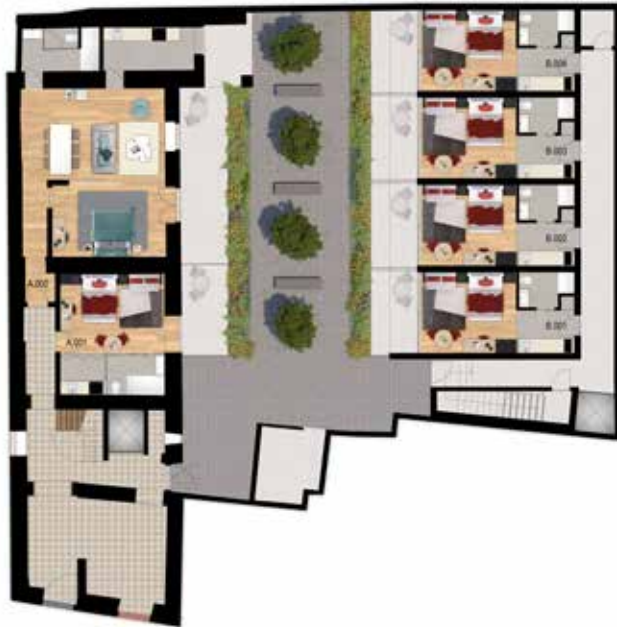
P000 - GROUND FLOOR